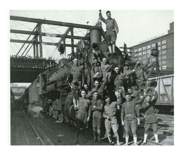
A farewell portrait during World War I.

Most Hispanics emigrated from Spain, Mexico, and Latin America. Thus, there was a significant barrier to training Latino patriots for military service if they lacked sufficient English language skills. Since the U.S. military was engaged in the war in Europe it needed men immediately. The U.S. went ahead and recruited Hispanics and offered them intensive training at Camp Gordon, Georgia. More than 4,000 Hispanics were trained for military service, but were often relegated to menial jobs and ridicule by their English-speaking military peers.