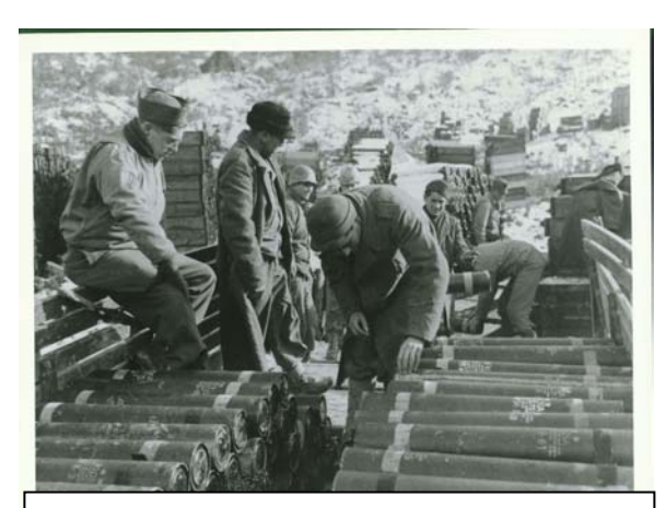
Checking materiel at a munitions depot.

After four months of heavy combat, with supplies exhausted, malaria, and without reinforcements, the U.S. and Filipino soldiers defending the Bataan Peninsula in the Philippines were overwhelmed by superior Japanese military forces and taken as prisoners on the infamous "Bataan Death March." There were approximately 16,000 captured U.S. soldiers on this fatal trek from the Bataan Peninsula to Manila Bay, The Japanese soldiers were not prepared to handle this many prisoners and they lacked transportation, food or medical supplies to provide for them. The Japanese soldiers forced their prisoners to march up the Bataan Peninsula some 85 miles to prison camps. During this 12-day "death march," many prisoners died from mistreatment by the Japanese soldiers, and fewer than 10,000 U.S. soldiers and several thousand of their Filipino allies survived the march. On this tragic march, the Hispanic soldiers that died in the march were mostly from units from New Mexico. They were moved to prison camps where some of the prisoners kept accounts of their mistreatment, including brutality, disease, and malnutrition.