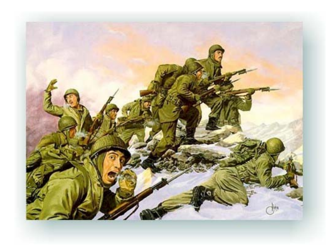
Military art. An American army unit on the attack.

An all-Latino combat unit that served with distinction during the Korean War was the Puerto Rican 65<sup>th</sup> Infantry Regiment. This unit was initially constituted as the Puerto Rico Regiment of Volunteer Infantry. There were two battalions, one at San Juan, Puerto Rico (PR) and the other at Henry Barracks, PR. When this unit arrived at Pusan, Korea on September 20, 1950, they saw heavy combat and long service. Over the next three years, they participated in nine major campaigns earning a Presidential Unit Citation, a Meritorious Unit Commendation, and two Republic of Korea Unit Citations. Members of the 65<sup>th</sup> Infantry Regiment were awarded four Distinguished Service Crosses and 124 Silver Star medals. These patriots were also credited with capturing 2,086 enemy soldiers and killing an additional 5,905 of the enemy.