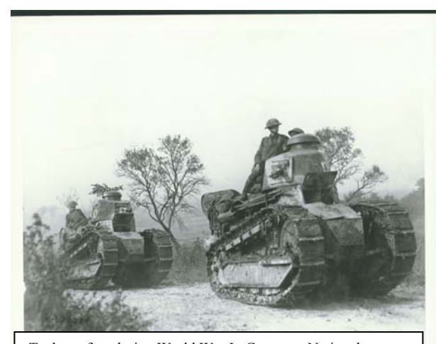
Tank warfare during World War I.

The language barrier posed the most obvious problem and after rudimentary interviews by military personnel, Hispanic recruits were grouped according to their language proficiency and were assigned officers who could speak Spanish. Most Hispanic draftees were trained at Camp Cody, New Mexico, but there were seven other camps where non-English speaking recruits were trained. This training for soldiers with limited English skills was called the "Camp Gordon Plan." However, WW I ended before its implementation.